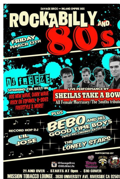
Promotional Flier for L.A.-based Sheilas Take a Bow: An Ode to Morrissey and the Smiths, March 2015. Courtesy of promoters. Used with permission.