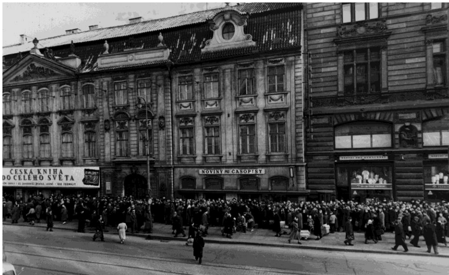
Picture IV: Queuing for Hanzelka and Zikmund's autographing of their books, Prague, 22 January 1958

Two registers dominated the viewers' reception of Hanzelka and Zikmund's travelogues as evidenced in letters: in the first one, the travelogues are used as a tool for virtual traveling, while the second one focuses on the visual attractiveness and spectacle that suppress both the educational frame and the narrative line of the movie.