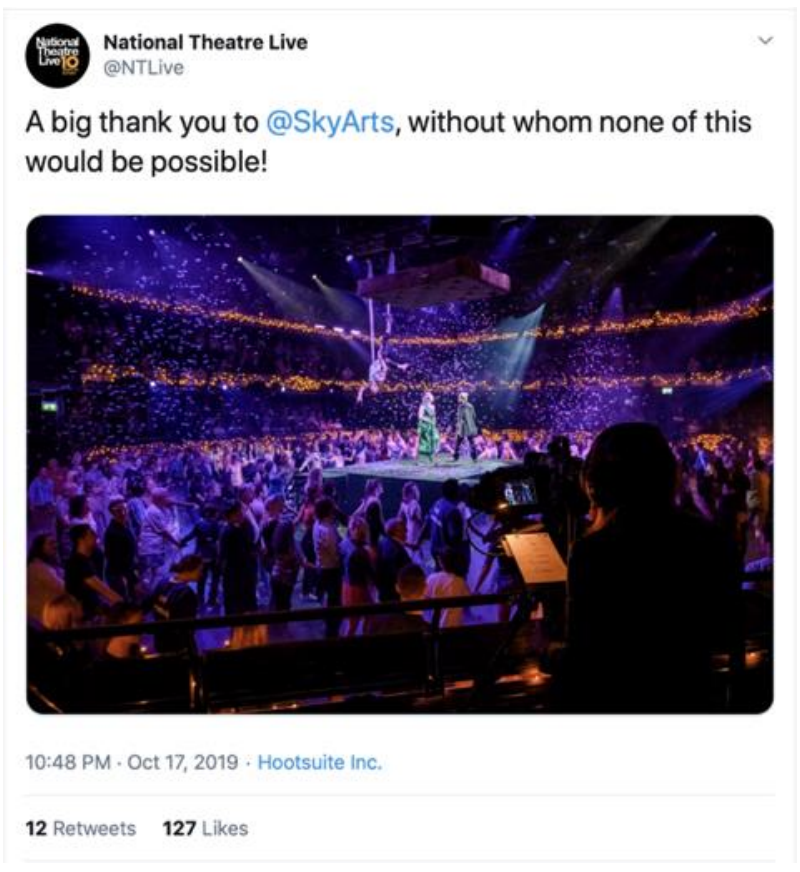
Figure 1. Screenshot from the NT Live Twitter Page showing a scene from A Midsummer Night's Dream , posted on 17 October 2019, taken on 24 October 2020.

In addition, the email already included the "NT Live announcement": "We're so thrilled to announce that NT Live will be streaming a recording of A Midsummer Night's Dream on 17 October [2019] to cinemas around the world. Perfect for those who can't make it to London this summer or who want to see the show again from a whole new perspective." Further email updates included new trailers of the show while it was already running, which gave an impression on what to expect and included several sequences in which audience members were the heart of the spectacle, as in the screenshot below: