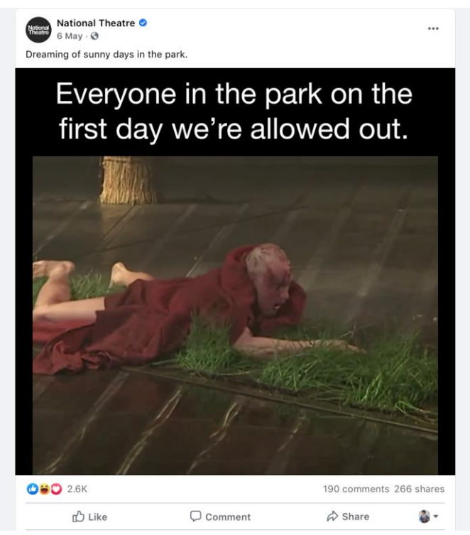
Figure 4. Screenshot from the National Theatre's Facebook page, posted on 6 May 2020, taken on 02 December 2020.