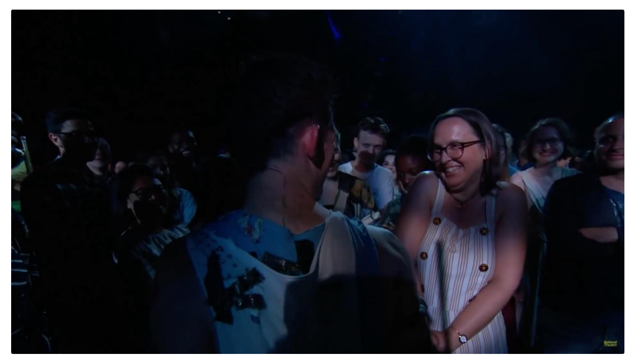
Figure 2. "I like your dungarees!" – Screenshot from A Midsummer Night's Dream when it was shown as part of NT At Home on YouTube between from 25 June–2 July 2020, taken on 25 June 2020.

what is reminiscent of Dennis Kennedy's terminology when he speaks of spectators assisting at a spectacle (2001), is that to accept the invitation to plunge into the spectacle, as in the case of A Midsummer Night's Dream , is to be pulled into it and become an integral part of it.