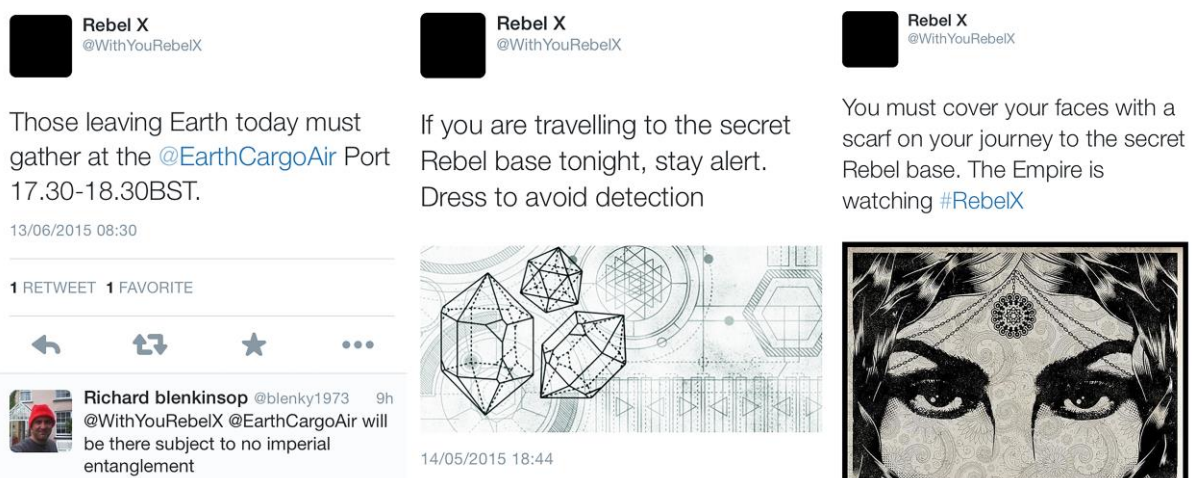
Figure 5: Examples of WithYouRebelX tweets.

In contrast to others, the 'secret' aspect is actually part of the narrative and intrinsic to the audience experience (particularly prior to the 5-hour evening event) - instead of resisting the covert approaches taken in other events (problems identified in Back to the Future ) the audience are readily engaging in the 'disconnect now' narrative, performing in character on social media, and compliant in the surrender of their mobile phones on entering the experience. Participants were invited to engage on social media using the hash tag #staydisconnected and the twitter account @WithYouRebelX (see Figure 5 ).