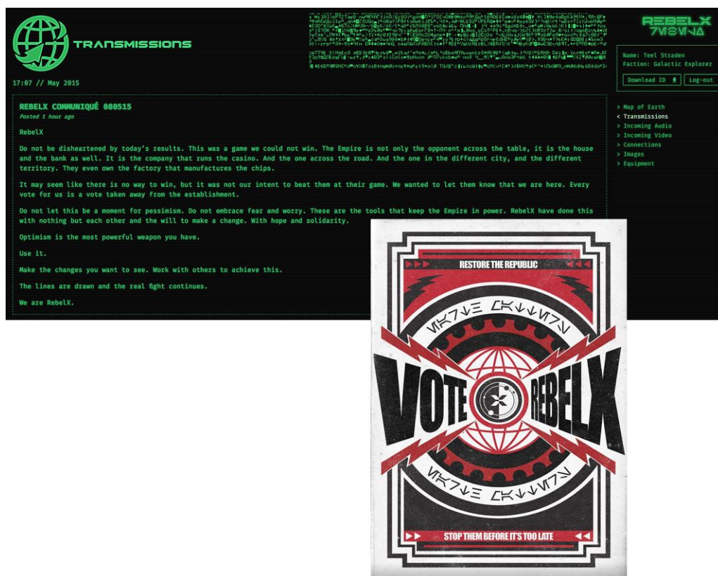
Figure 3: The REBEL X Communication channel showing Secret Cinema's in-fiction response to the real-world UK general election, May 2015.

In this event Secret Cinema also further aligned themselves with dominant mainstream media narratives through the inclusion of refugees into the opening narrative of the experience and their sponsorship of their partner charity the Refugee Council for which they raised £28,000. Secret Cinema furthered this alliance through the high profile screening at the refugee camp in Calais. 7