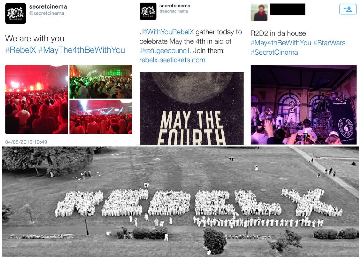
Figure 6: "May the 4 th be with you" – the International Star Wars Day was used to advantage as part of the Secret Cinema marketing campaign.

Secret Cinema's core commercial identity could be argued to capitalise on the wider cultural trend or taste for experiences which are deemed to be exclusive. The whole clandestine marketing campaign focuses on building the mystique of these experiences. Exploiting the audience desire to be 'cool' and through the expensive ticket price (£75 per ticket) generating this elite sense of distinction, exclusivity and 'subcultural capital' (Thornton: 1996) for the participants. This sense of distinction was further compounded through a manipulated tickets shortage in line with a temporally relevant external event. Tickets sales were available briefly and then re-released on May 4 th , to coincide with national Star Wars day ('May the 4 th be with you').