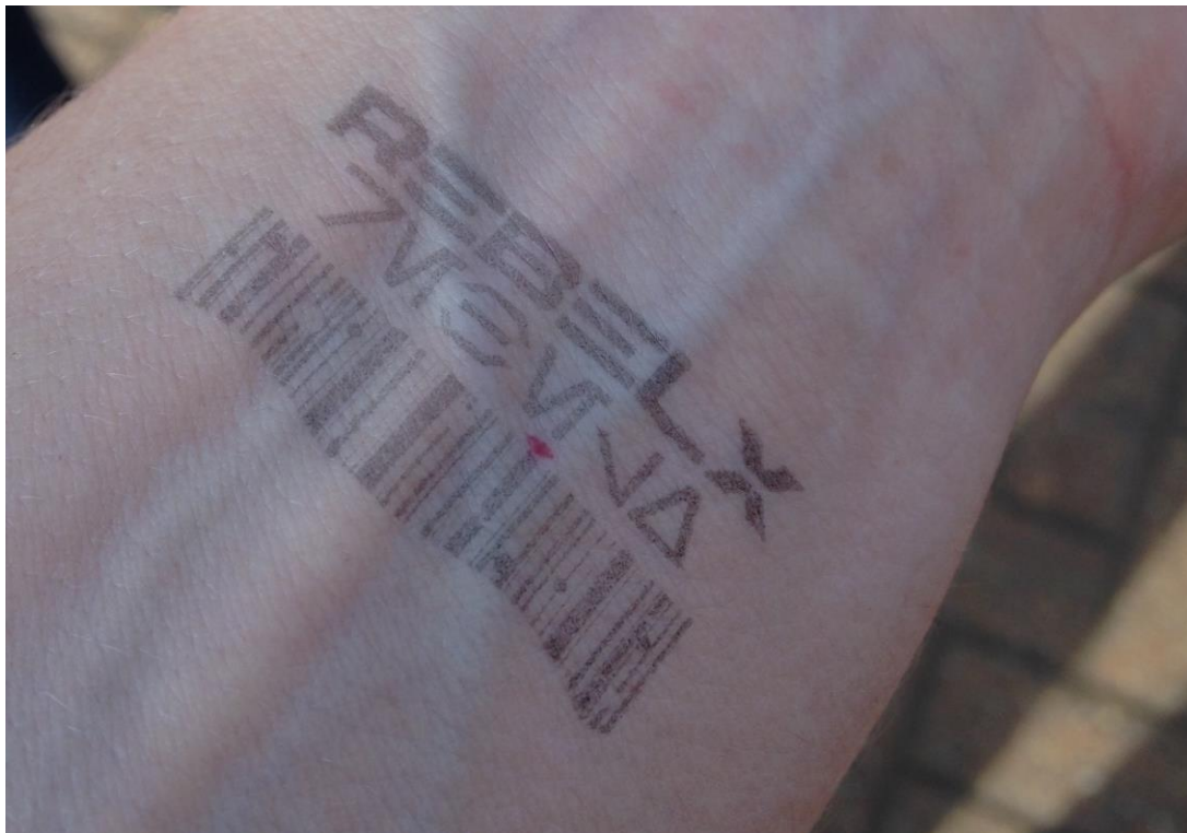
Figure 7: Entry stamp