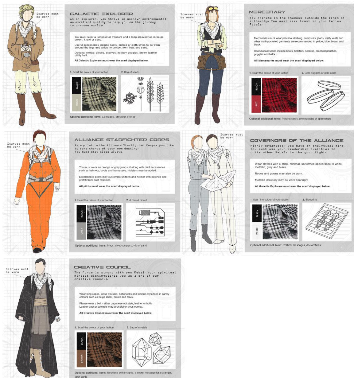
Figure 8: The range of identities assigned to the audience participants

These highly controlled moments were reminiscent of similar staged interactions with the Shawshank 'inmates', the novice performers could run through the somewhat militaristic and mechanical drill with minimal room for deviation or improvisation on their own or the audience members part. An emergent formulaic pattern suited to the limited capacities of the performers and the narrow expectations of the audience members to be guided, controlled and shepherded through the experience is becoming characteristic of the Secret Cinema event design.