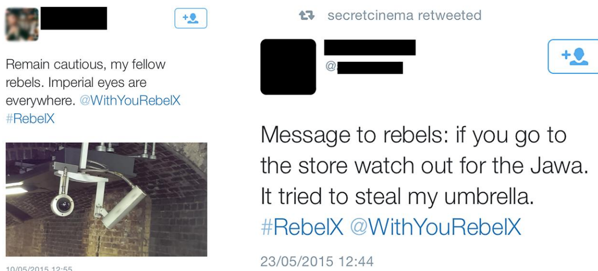
Figure 2: In-character tweets from audience members on social media

Within the social media mise-en-scène, secrecy became a fundamental aspect to the mode of address for the audience and intrinsic to the pre-event experience. Instead of resisting the covert approaches taken in other events (creating problems such as those identified in Atkinson & Kennedy: 2015b) the audience could now readily engage in the ‘stay disconnected’ narrative, performing in character on social media (see Figure 2 ).