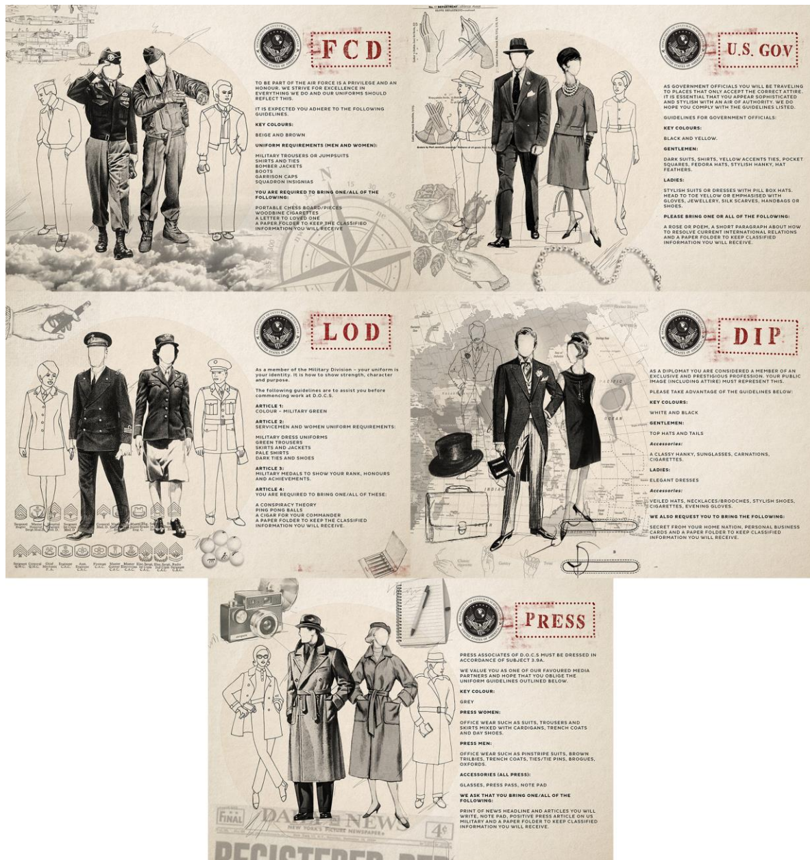
Figure 9: The identities being assigned to current Secret Cinema participants 2016)