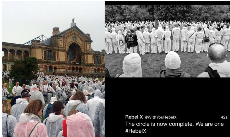
Figure 4: The launch event at Alexandra Palace, London, UK, May 4 th , 2015.