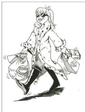
Picture 3c. The forever young, wanting to look and behave like younger people

own rules, for example. The willingness to change seen within this discourse can also be found within the consumer type resisting presented by Booming Experience (2012).