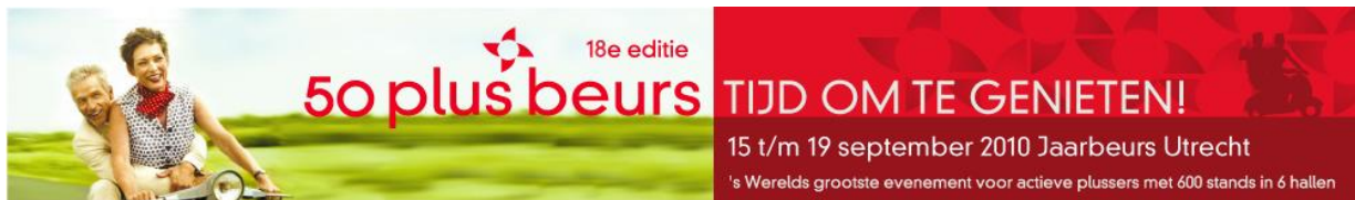
Figure 2: Visual representation of senior citizens as eternally youthful

Note. Adapted from the 50 plus beurs Vier 't leven [Trade show Time to enjoy life for over fifties], retrieved from http://www.50.plusbeurs.nl